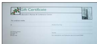
Above— Gift Certificate for a Program or a quiet Retreat

Visit us and check out the variety and assortment of books, CD's, calendars, all occasion cards, prayer beads, jewelry and T-shirts. Or, you may want to treat that special person with a Gift Certificate for a personal Retreat, Reike treatment or one of the special programs offered at the Centre. Drop by and have a look at our unique and varied selection.