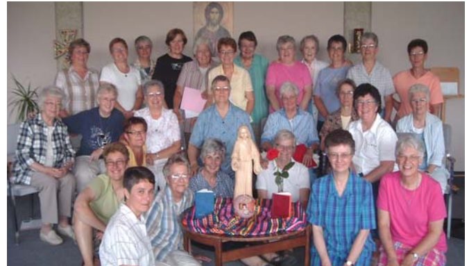
Sisters of the Holy Names of Jesus & Mary and Associates Retreat held in August, 2009