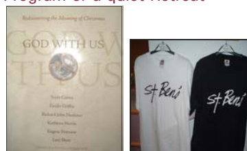
Above — Book— Rediscovering the Meaning of Christmas 'GOD WITH US' ; St. Ben's T-Shirt—sizes S-XL.