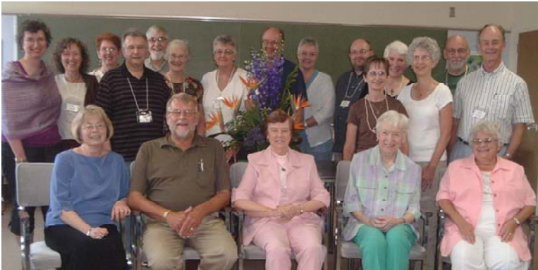
Centering Prayer workshop participants August 12-14, 2009 Visioning Event for Contemplative Outreach Canada