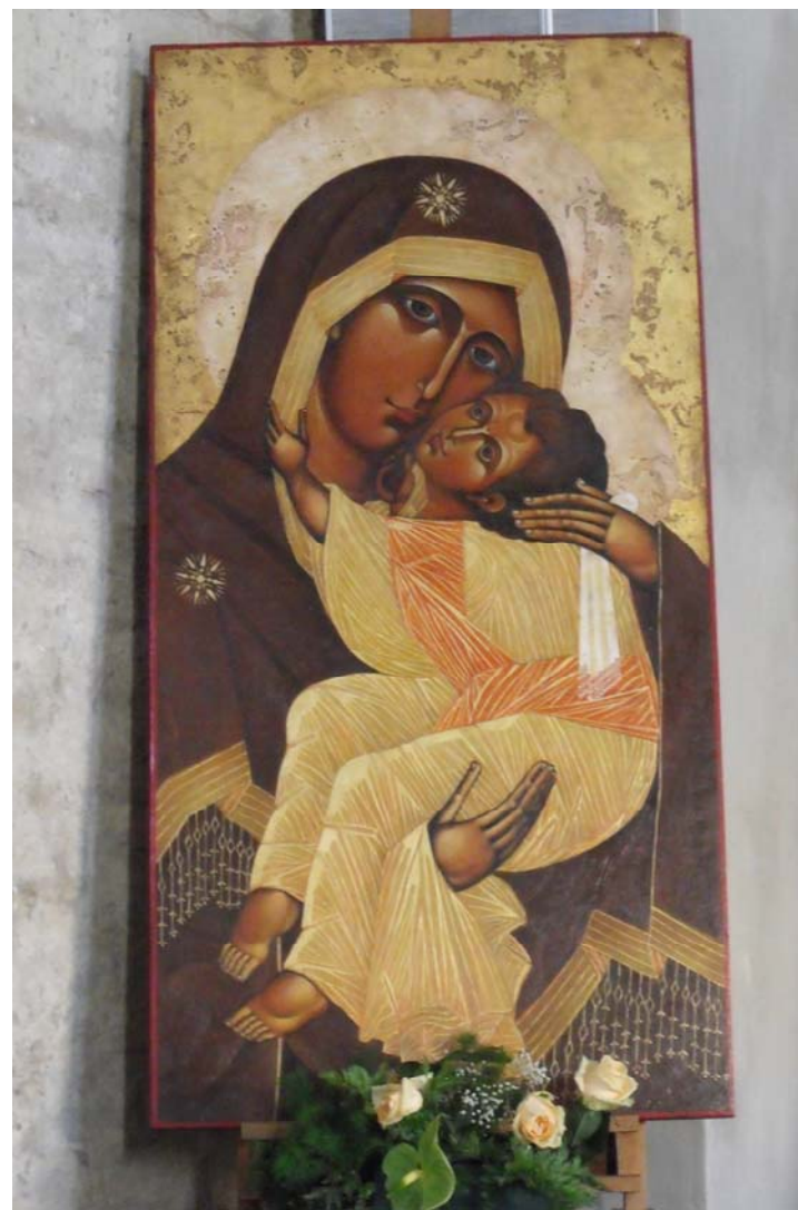
Icon of Mary and Jesus at the Church of St. Eutizio, Italy